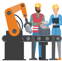
Manufacturing - Durables